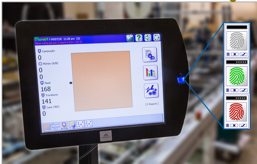
SEQUIRE ID LSI