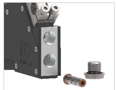
Integrated adhesive filter