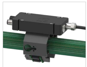
Detached electronics module