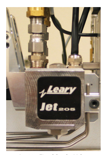
Jet 205 Fixed Stroke Valve