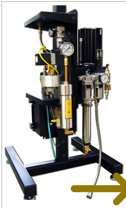
4:1 / 9:1 Pump